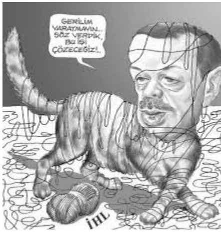
Daily Cumhuriyet, 9 May 2004;İHL: Religious high schools

As to the peace initiative concerning the Kurdish movement that Erdoğan started in 2009 (›Kurdish Opening‹) in tandem with the imprisoned PKK leader Abdullah Öcalan, it was put in an awkward position when in November 2013 the prime minister invited to Diyarbakir Mesut Barzani with whom he conjointly pursued a policy against the Kurds of Syria. Barzani, leader of Kurdistan Democrat Party of Iraq, is the political rival of Öcalan who supports the Syrian Kurds.